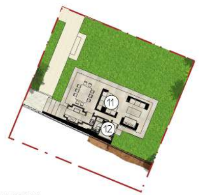
1ST FLOOR LOWER LAWN ROOM