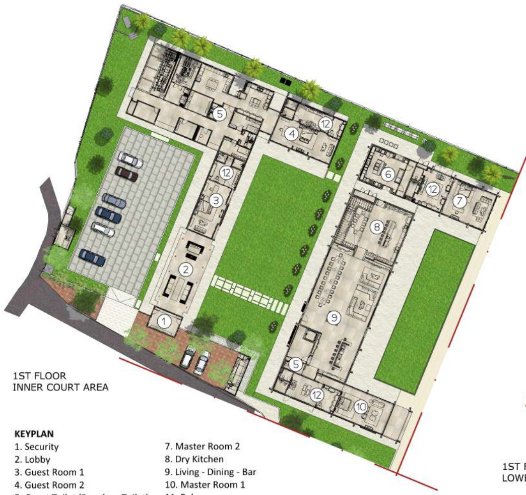
1ST FLOOR INNER COURT AREA