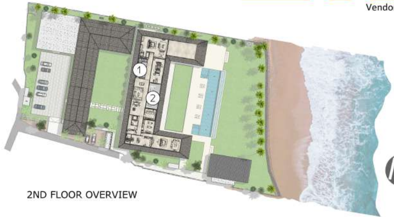
2ND FLOOR OVERVIEW